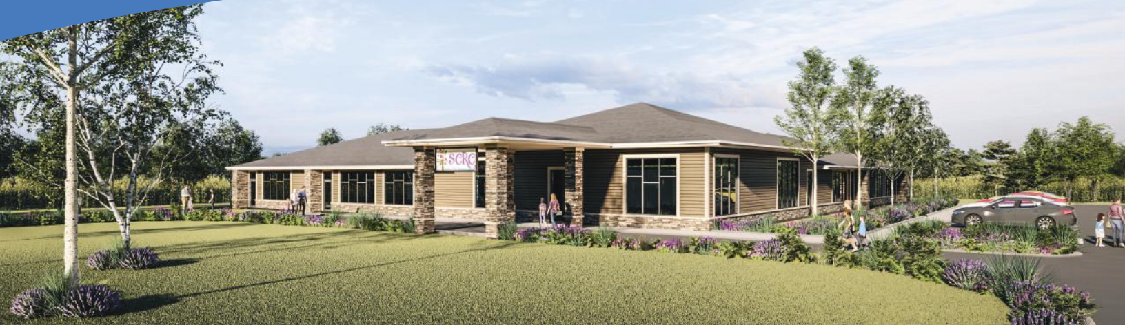
Stanton Child Resource Center

Committed to welcoming friends – both new and old.